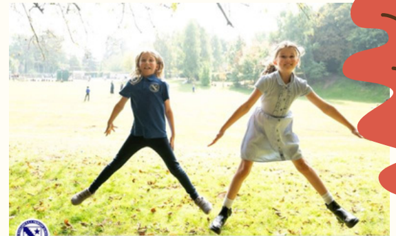
Dr Radcliffe's C of E Primary School, Steeple Aston

We hope you will have a restful week's holiday and we look forward to Term 2.